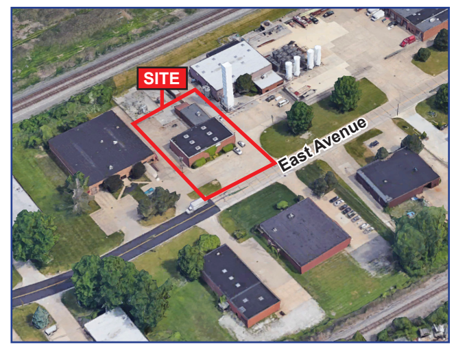
* Parcel lines for illustration only; not exact.

Eric M. Silver, Broker / 216.504.5000 / info@agrealestategroup.com